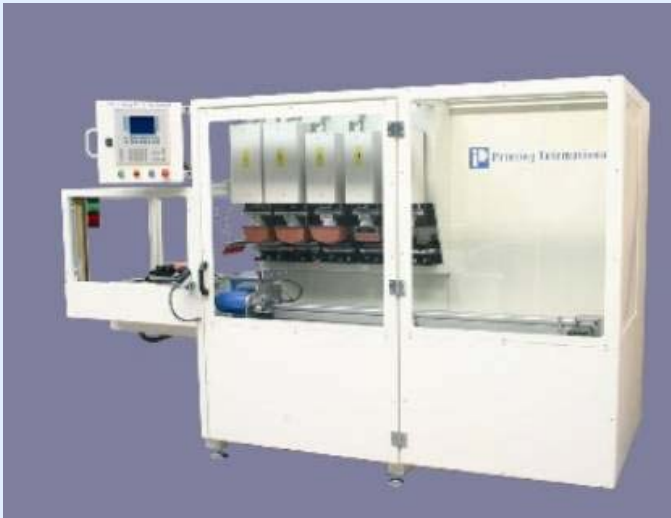
Linear Index System

Optionally the machine can be adapted for use of thermoplastic inks to print on glass, ceramics and china (cosmetics, catering industry, pharmaceutical industry,... ).