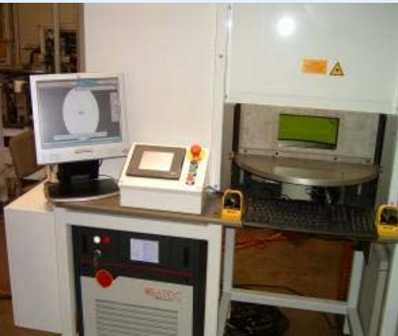
Laser Work Station with Rotary Index Table