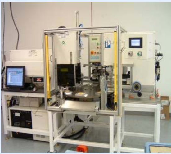
Color Laser System with choice of any 4 color shades