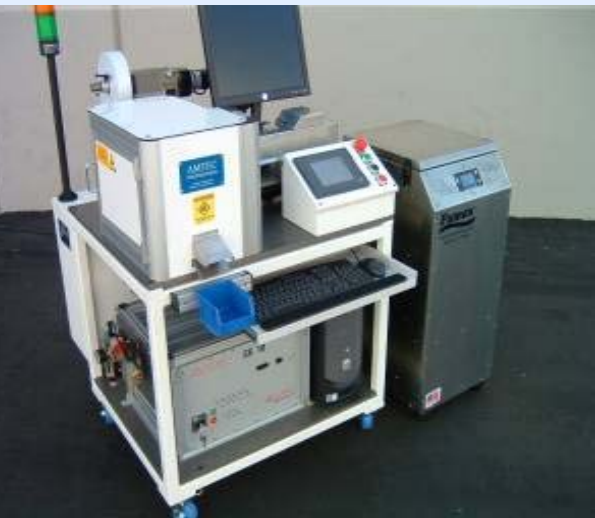
Label Marking with Auto-feed, Programmable cut-to-length unit and Fume Extractor