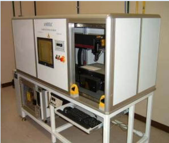
Laser Work Station with Sliding door, high resolution X-Y Table & Vision System