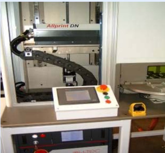
Programmable Z-axis with Auto-Focus for Laser Focal Length