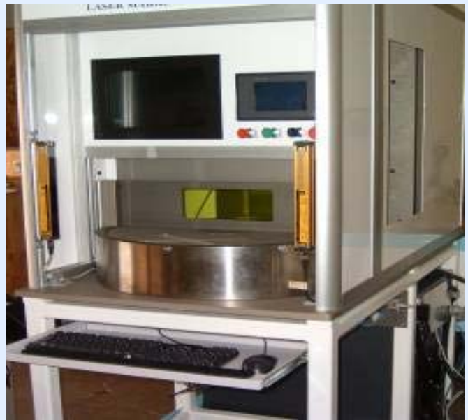
Laser with Integrated Touch Screen & Operator Safety Light Curtain