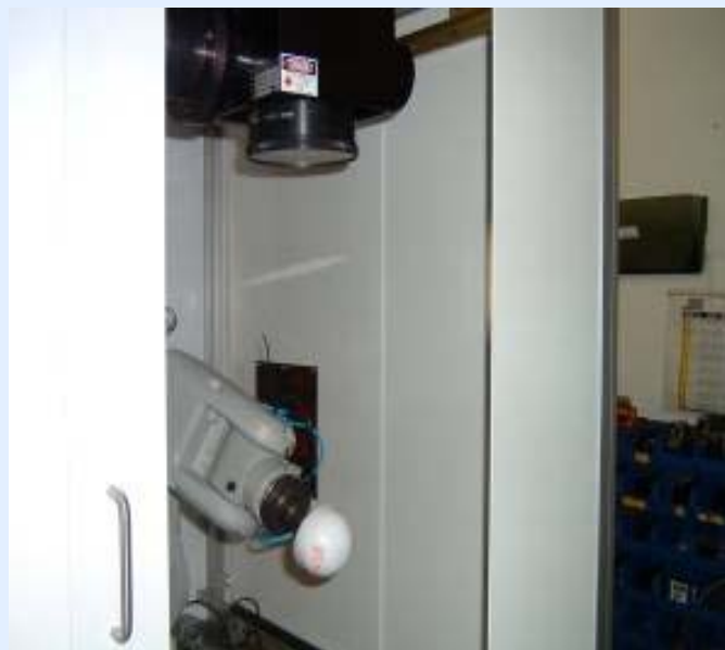
6-Axes Robot Handling Medical Implants for Contrast Laser Marking on UHMWPE