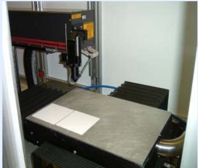
Fixed Beam Delivery System with Programmable X-Y-Z axes for Cutting & Scribing applications