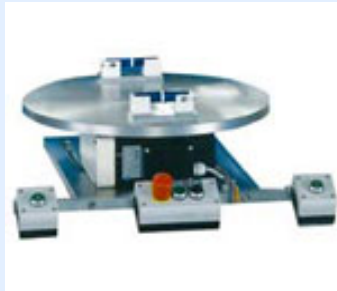
Rotary Index table -for feeding