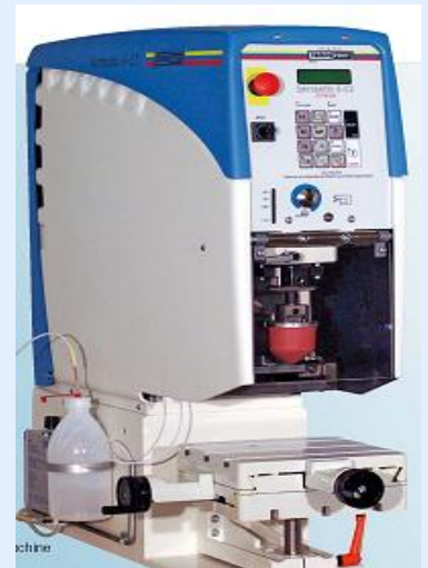
Thinner Metering System mounted to pad printing machine