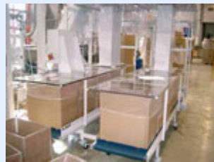
Cardboard box roller belt