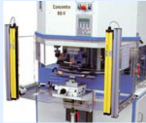
Light curtain for added security