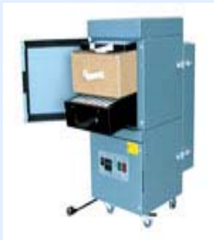
Suction and filter unit