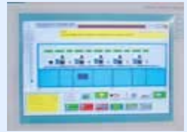
Touch screen panel