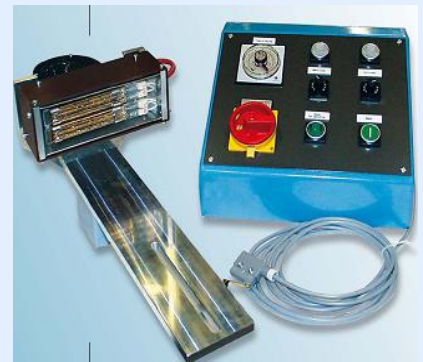
Infrared Drying (Compact)