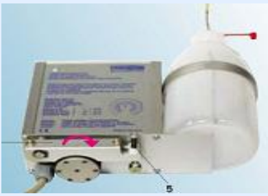
Assembly Thinner Metering System Mono